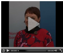
Paula Lehtomäki, secretary general of Nordic Council of Ministers