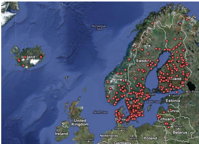
Map of sites.

The overall goal of this project is to build a meta-database which identifies and documents forest research sites in Fennoscandia and the Baltic states where water chemistry data have been measured. The meta-database locates and catalogues studies where nitrogen (N), phosphorus (P) and dissolved organic carbon (DOC) have been measured in soil and stream water from intact and harvested forests.