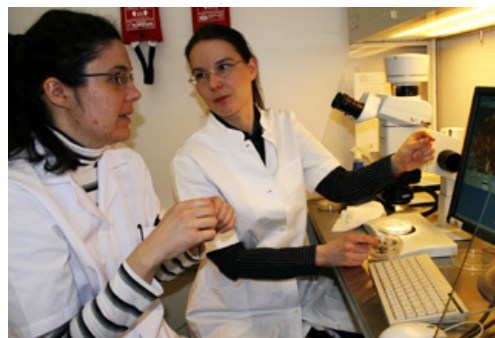
Examining tissue cultures in a laminar hood.

A visit lasting from several weeks to several months, depending on research topic. Before arrival, a work plan will be agreed. A guest can arrive with his/her own materials or the EVOLTREE Punkaharju ISS Infrastructures can be utilised as explant source. During the stay, the guest performs for example tissue culture initiation, proliferation/ multiplication, SE maturation, plantlet rooting / SE germination, or clonal identification experiments, supported by the guidance of the host scientist and technicians. Results are collected in or converted to computer files. Data analysis and interpretation are based on in-house experience with software available. If possible, reports and manuscripts will be prepared while the guest is still at the site, or by e-mail exchange afterwards.