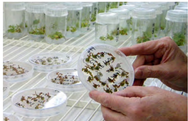
Birches regenerated from cryopreservation

Results are digitalised. Data analysis and interpretation are based on in-house experience with software available. If possible, reports and manuscripts will be prepared while the guest is still at the site, or by e-mail exchange afterwards.