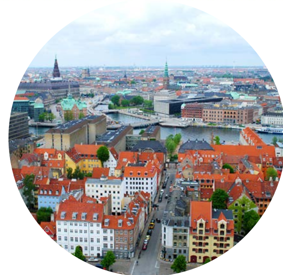
Copenhagen, Denmark has recently included diversity targets in their urban tree strategy.

A prescription includes a list of species to be planted and also their abundances. At a minimum, a prescription should also include a structural description (i.e. size and form); known environmental limitations (e.g. soil moisture, compaction, salt); and potential for invasive behaviour. It may also include each species' suitability for specific planting environments (e.g. street, park, parking lot, residential) and the ecosystem services/disservices associated with the species.